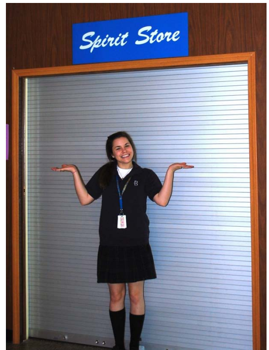
The Spirit Store received the same face lift!

The new additions and enhancements, made possible by the generosity of our Bridge The Gap donors, have our students jumping for joy!