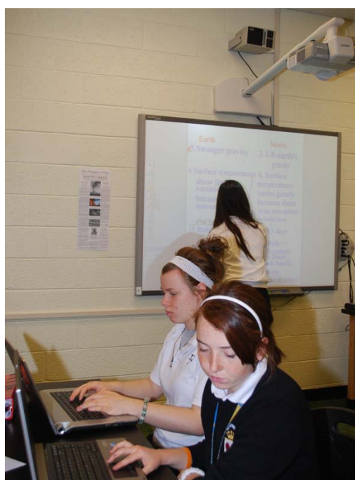
Students utilize laptop computers located in the classroom as well as to provide hands on opportunities to enhance learning through technology.